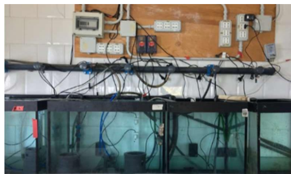
FIGURE 1 – Prototype used for research

The system is fully thermoregulated and controlled to ensure constant experimental conditions. It allows automatic culture of different organisms, benthic or planktonic (including small copepods and soft-bodied organisms) thanks to special dosing rings used to perform water changes without producing pressure on the body. It can be used to produce and reproduce invertebrates and fish in temperate or tropical waters.